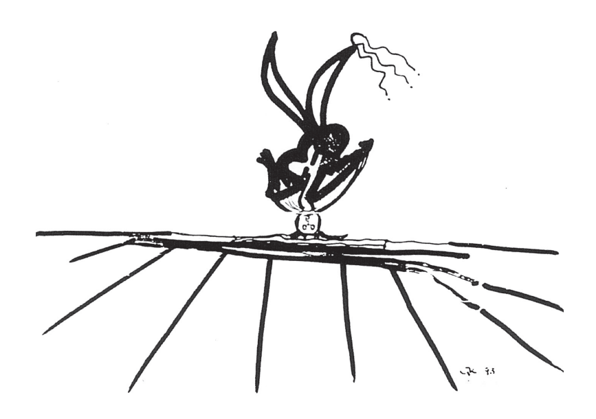
If it's a touch of a solution, then it's not a solution.